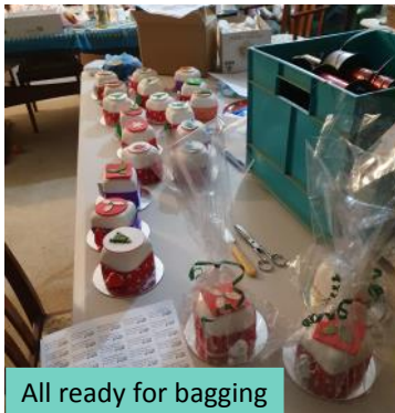
All ready for bagging